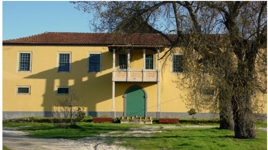
Quinta do Romeu winery in the 20's and today.