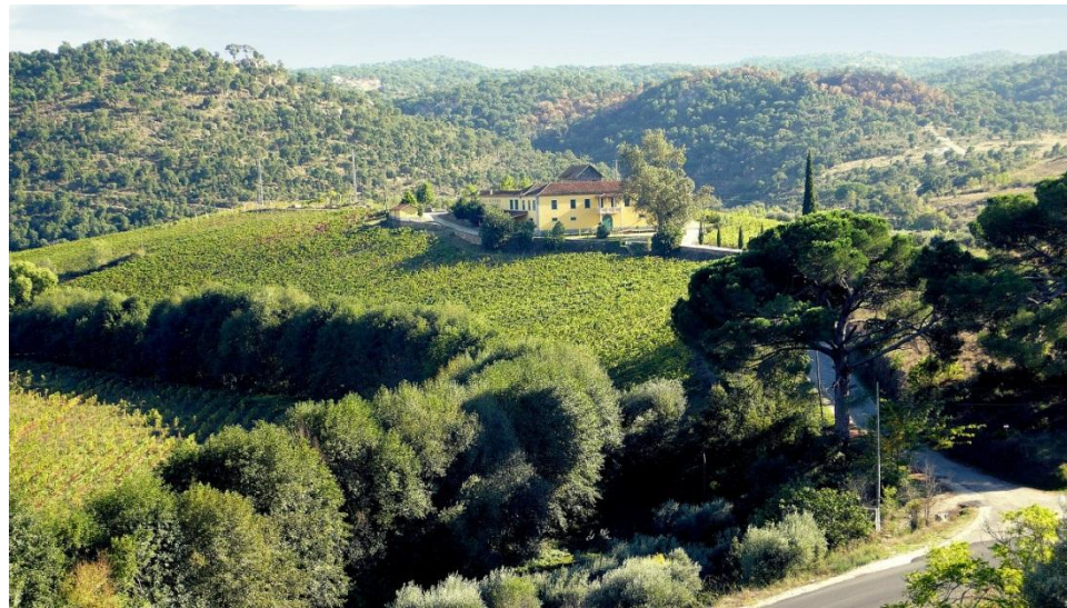
Quinta do Romeu winery, some vineyards and cork forests.

Clean and fruity indigenous wines with character from Portuguese traditional varieties.